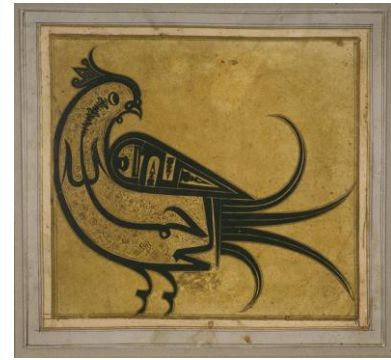
Fig. 3. In the name of the merciful , calligraphy in the form of a hoopoe, Iran, 17th/18th century, ink on paper, 42.4 x 35.6 cm.

Significantly, the first issue of the Fighting Rooster magazine starts with the poem “About the city of the morning” by the avant-garde poet Nima Yushij (1895–1959) (fig. 4). The poem narrates the journey of a rooster accompanying a caravan through Iran. The rhythm of the movement follows the rooster’s crow, “cock-a-doodle-doo,” and is an invitation for the audience to join the caravan, to escape night and darkness and strive for a new morning. With his poem, Nima illustrates the artist association’s goal to educate the audience and to change and revitalize society, as one can also discern from the cover: “Our declared aim: Increasing the culture of Iranians by the association of Fighting Rooster.” 41 Nima also communicates in this poem his political ambitions through a reconfiguration of familiar images of Islamic literature, Sufi metaphors, and motives of traditional Persian literature. The usage of images and metaphors from Persian literature made the Fighting Rooster ’s political messages comprehensible to the Iranian masses, for whom poetry is part of a living tradition and always has been a widely practiced part of Iranian cultural identity, regardless of class or education.