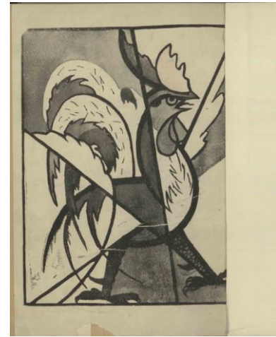
Fig. 2. Jalil Ziapour, cover of Korūs-e Jangī magazine, vol. 1, Tehran, 1948.

In a black-and-white print on the magazine’s cover, Ziapour gave the association the face of an aggressive rooster angrily looking down its tong-like beak, with its forked tongue darting out (fig. 2). The subtext within the image and its framing is a structural reference to Iranian miniature painting, which creates a strong interconnection between text and image, as the picture’s caption, horus changi (“the fighting rooster”), specifies. Strong lines shape the rooster’s